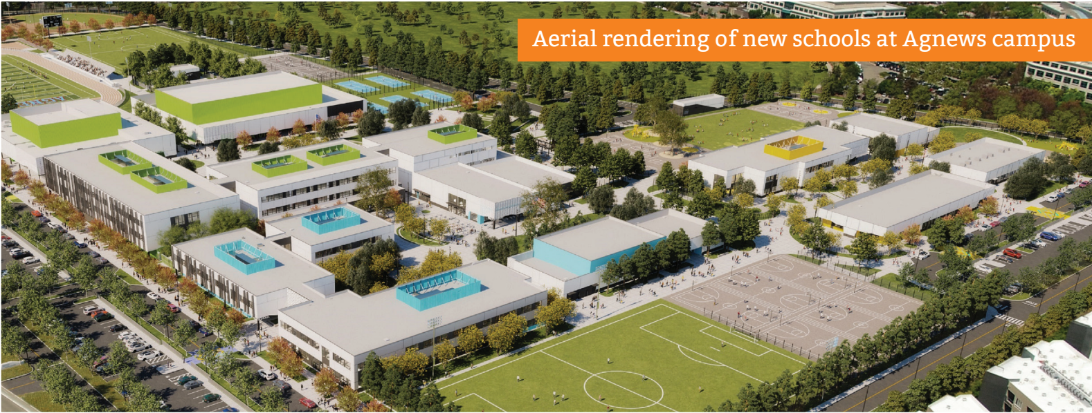
Aerial rendering of new schools at Agnews campus