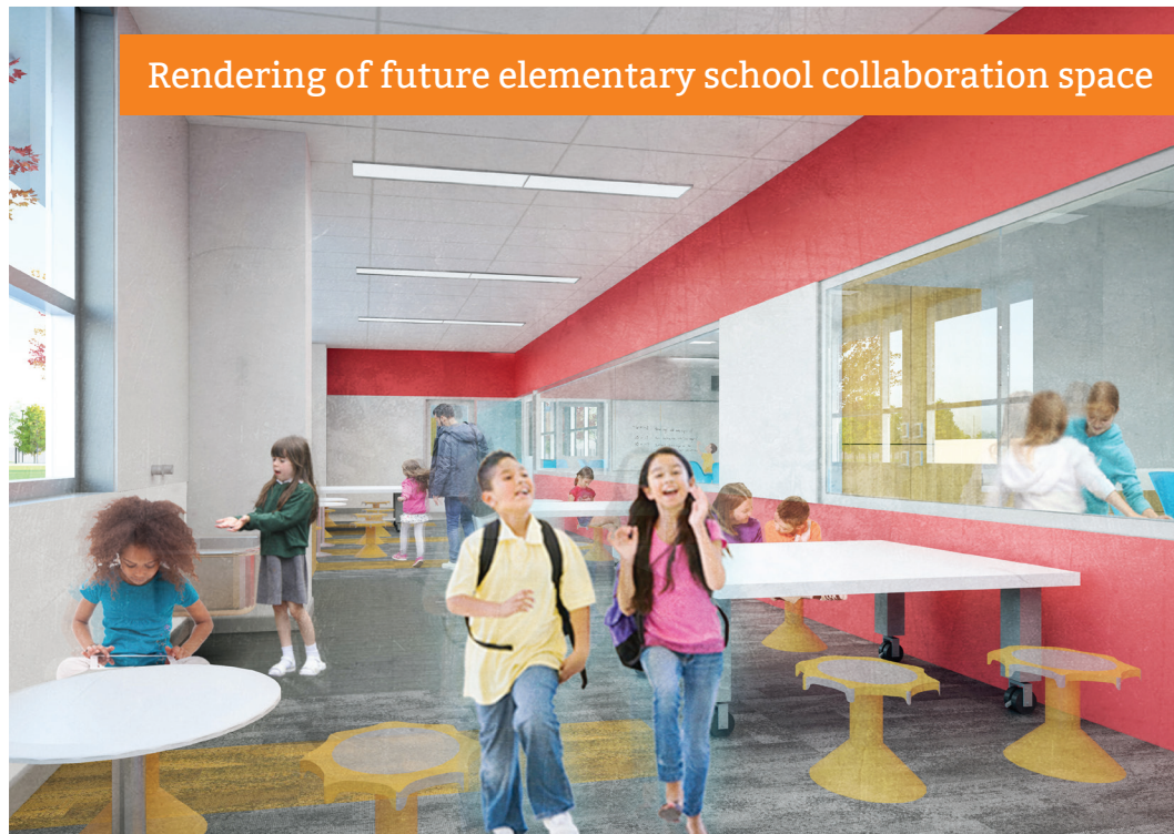
Rendering of future elementary school collaboration space

We will review proposed boundary changes; discuss timelines for opening the elementary, middle, and high schools; and integrate your input into the planning process.